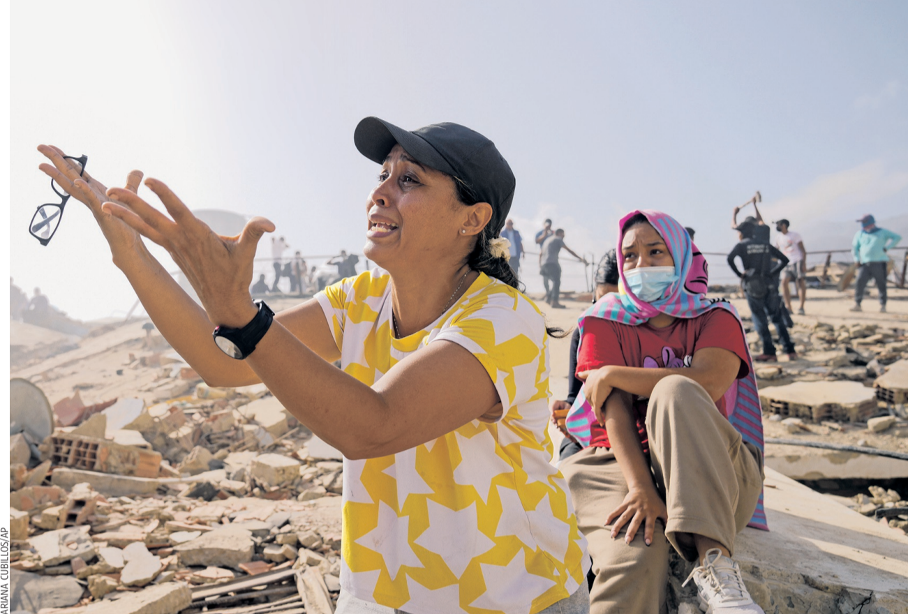
HOLDING OUT HOPE: People search for missing loved ones Friday at a collapsed building in La Guaira, two days after powerful twin earthquakes rocked Venezuela, killing more than 900 people and plunging the acting president into her first crisis. A7