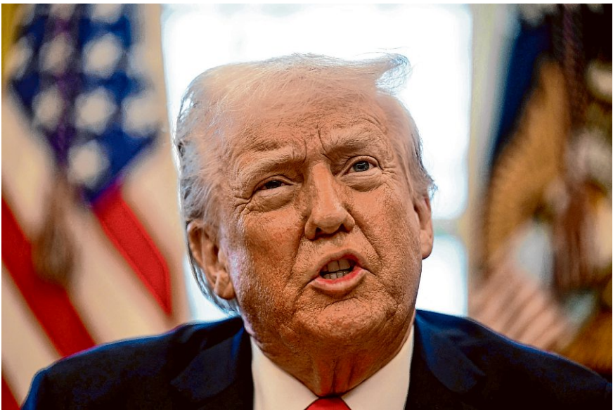
After the shooting, President Donald Trump said “the radical left” was “directly responsible for the terrorism that we’re seeing in our country today.”