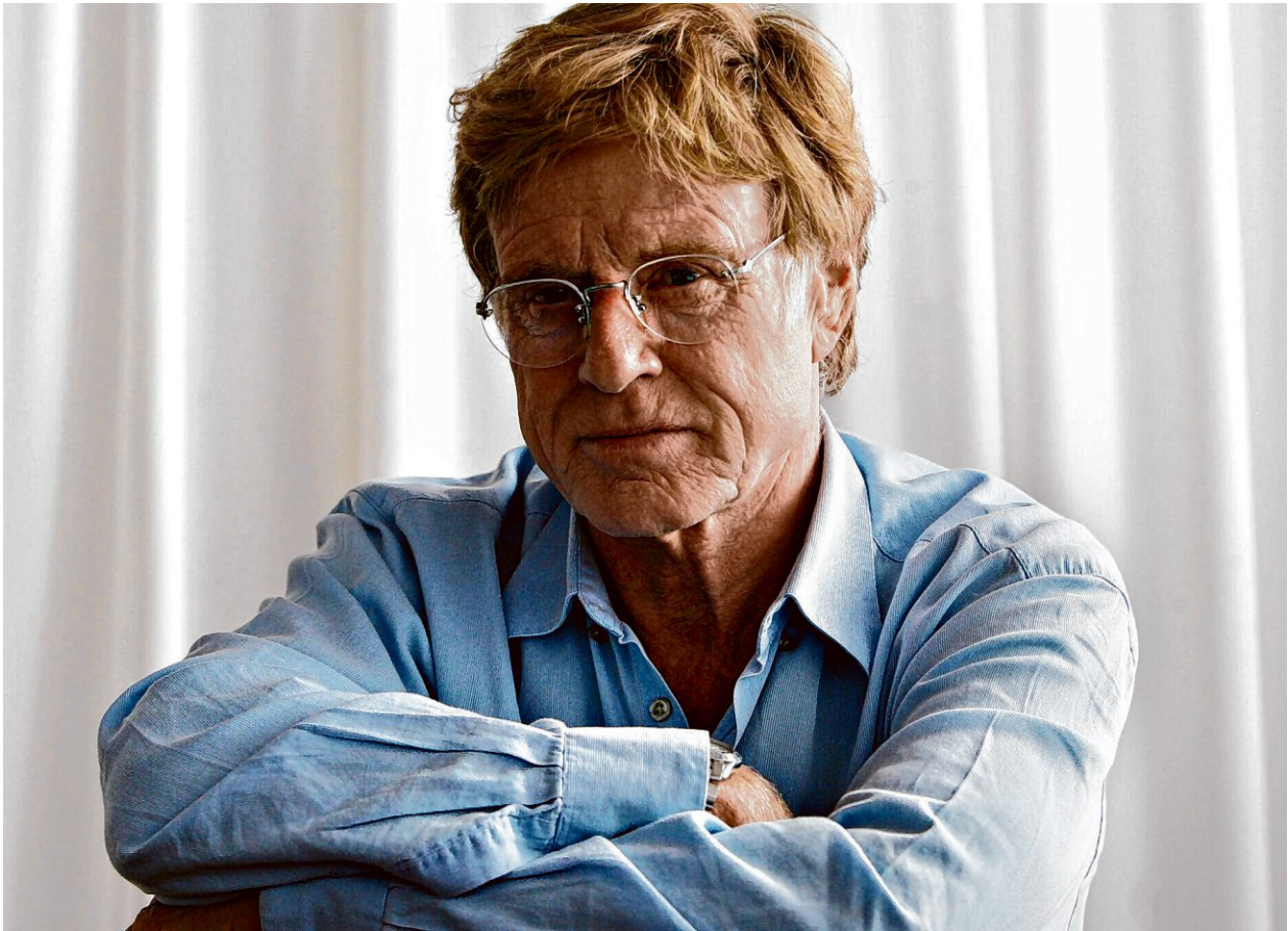
Robert Redford, an iconic leading man who became a liberal activist and a champion of independent film through the Sundance Institute and its famous festival, died at his home outside Provo, Utah. He was 89.