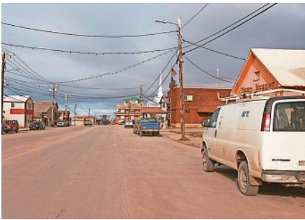
National security interests – and a changing Arctic climate – are drawing new attention to Nome, Alaska.

In a tiny gold mining town on the edge of Alaska, the Trump administration is poised to begin building America's first Arctic deepwater port, with significant implications for military security and tourism. Nome, Alaska, lies on the edge of the Bering Sea, less than 200 miles from mainland Russia. Nearly 30,000 people lived there during the 1899 gold rush, but today only about 3,000 people call Nome home.