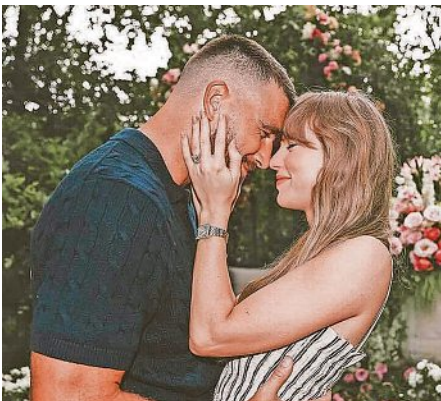
Travis Kelce and Taylor Swift announced their engagement via Instagram on Aug. 26.

Preservation Hall in the French Quarter is dedicated to preserving the tradition and sound of New Orleans jazz.