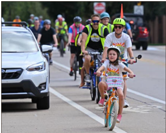
Cyclists ride along Ridge Avenue on the North Side during the 31st annual event.