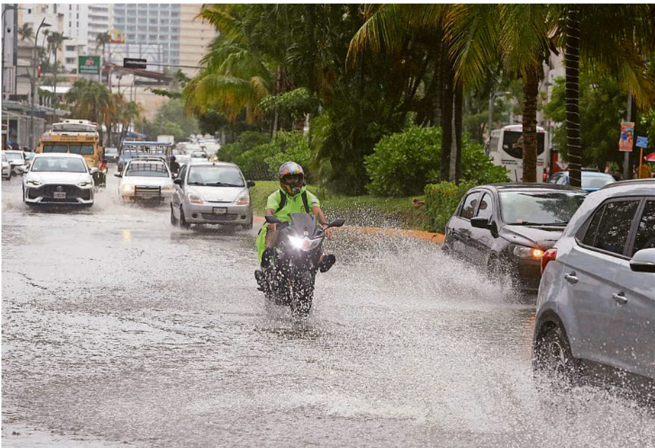
Motorists make their way down flooded streets in Acapulco, Mexico, on June 29 before Tropical Storm Flossie grew into a hurricane.

Some say the name may not exactly inspire fear