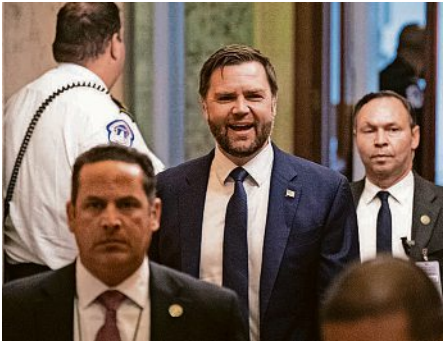
Vice President JD Vance arrives July 1 to cast the tiebreaking vote to get the president's bill across the finish line in the Senate.

Party casts net for help, but she avoids politics