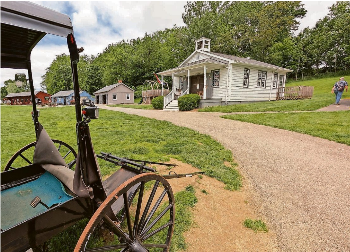
Amish wagons are on display in front of the schoolhouse at The Amish Village east of Lancaster, Pennsylvania. The village is a simulation of an Amish farm, complete with a farmhouse, a barn with goats, a one-room schoolhouse, a market, an ice cream parlor - and a gift shop.

Amish villages have a nosy new neighbor: Tourism