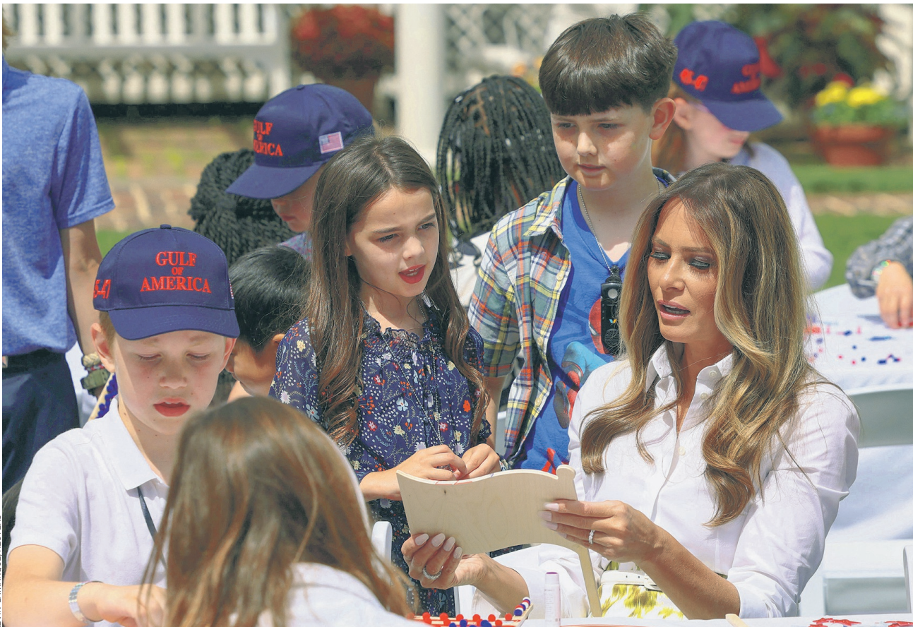
YOUNG AIDES: First lady Melania Trump hosted staffers’ children at the White House on Tuesday, helping them with crafts.