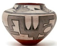
Native American Acoma Polychrome Pottery Olla.