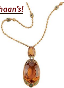
Attributed to Louis Comfort Tiffany, Tiffany & Co. Citrine, Enamel, 18k Yellow Gold Necklace. Summer Fine Auction

Summer Fine Auction Thursday, June 12th; 10 am Preview: Sunday, June 8th; 10 am - 5 pm Thursday, June 12th; 9 am - end of auction