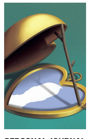
PERSONAL JOURNAL Want to avoid an online romance scam? Take a quiz to find out what to watch for. A12