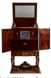
Sparks-Withington Sparton Visionola Type C Projector Console

All Lots to be Offered in our February Gallery!