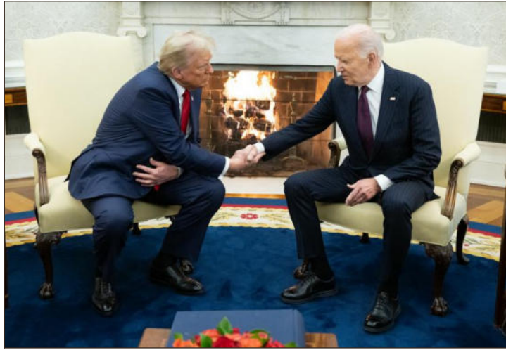
President-elect Donald Trump and President Joe Biden meet Wednesday in the White House. After a public greeting, they talked privately.