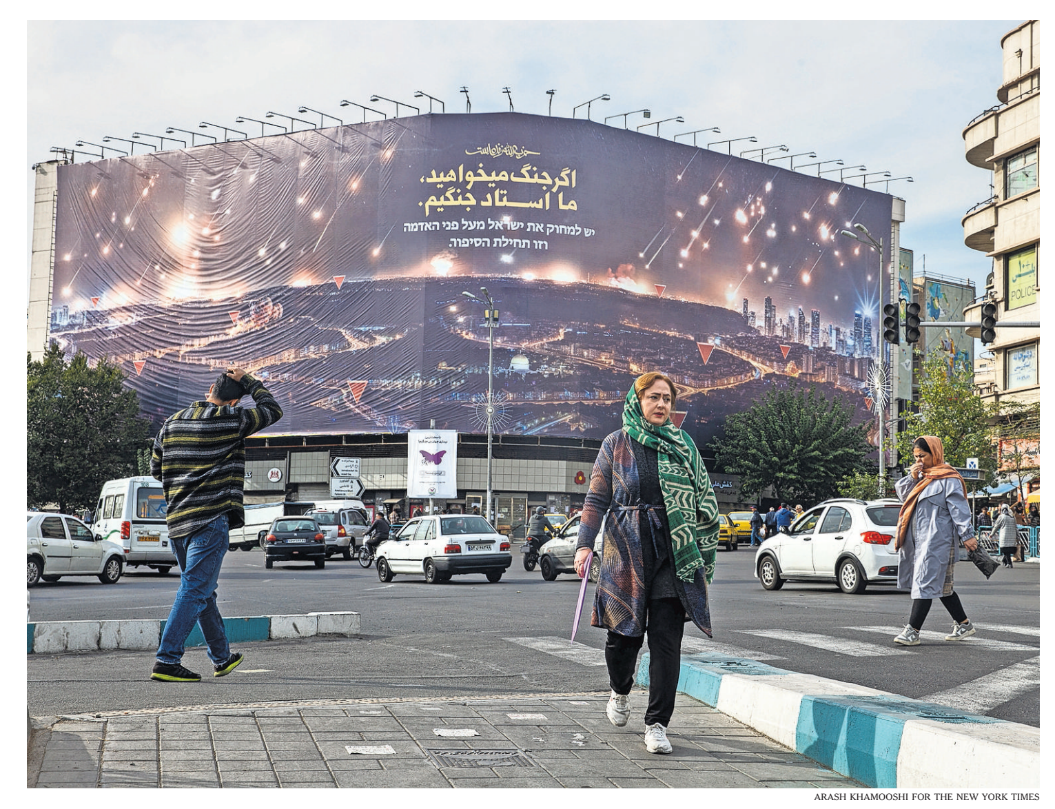
A billboard in Tehran threatening Israel. Iranian institutions projected a sense of normality after an early-morning Israeli attack.