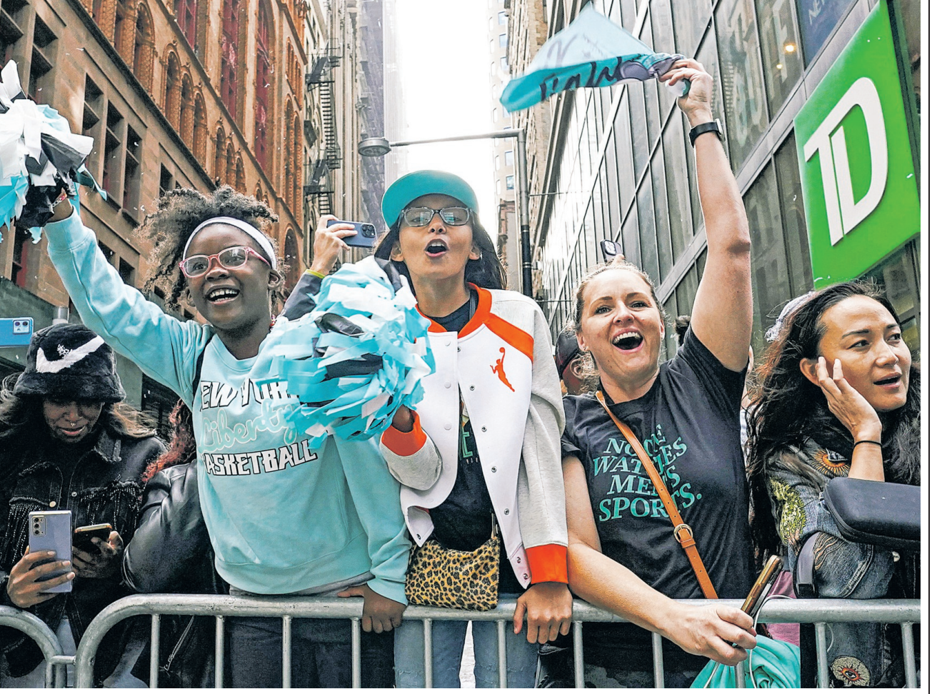
BIG SHOTS: Thousands gathered in Manhattan's Canyon of Heroes for a ticker-tape parade on Thursday to honor the Liberty basketball team, winners of the WNBA championship. It was the Liberty's first title win since the team's debut in 1997.

Russia provided targeting data for Yemen's Houthi rebels as they attacked Western ships in the Red Sea with missiles and drones