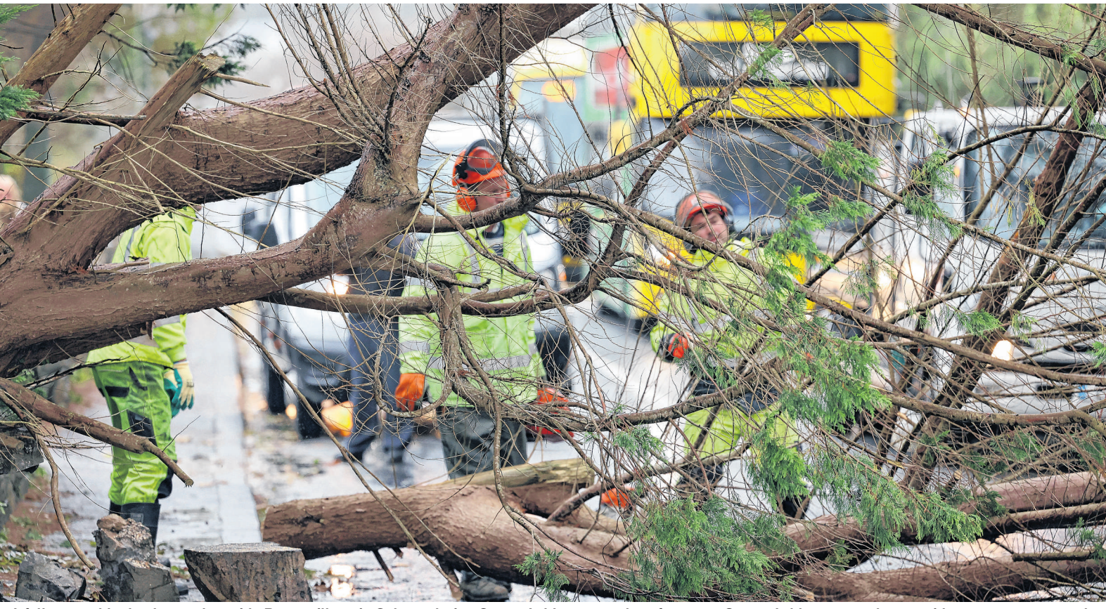
A fallen tree blocks the road outside Barna village in Galway during Storm Ashley yesterday afternoon. Storm Ashley causes havoc with power outages and disruption at airports: page 3