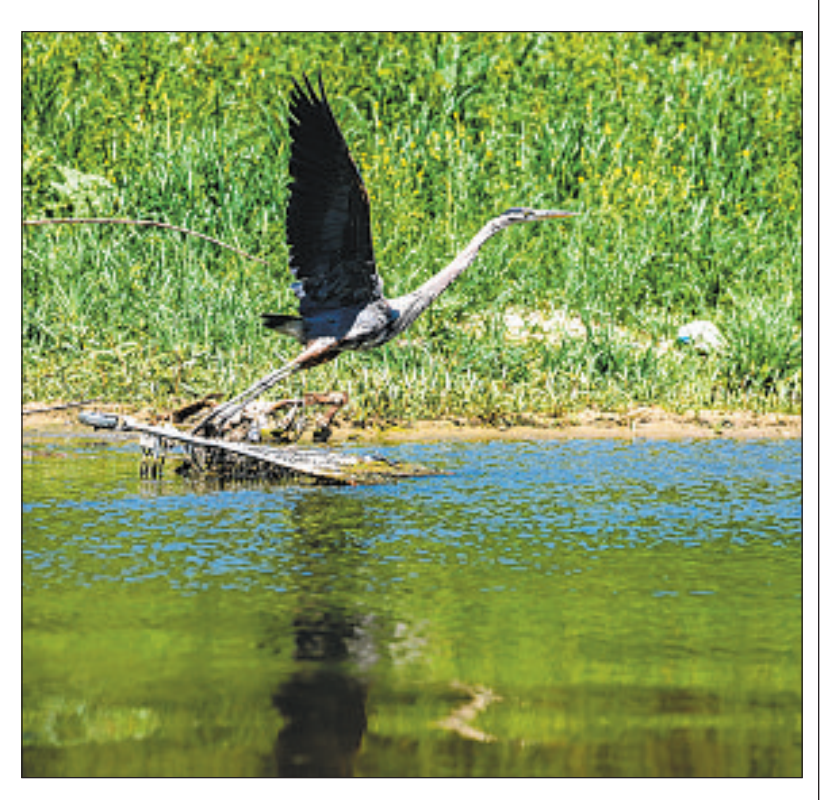
A GREAT BLUE heron takes flight from one of the few spots where the Los Angeles River isn't straitjacketed in concrete.

She was diagnosed in November, [See L.A. River, A7]